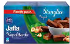
26. Jaffa wafers cocoa coated Nougat / 360g