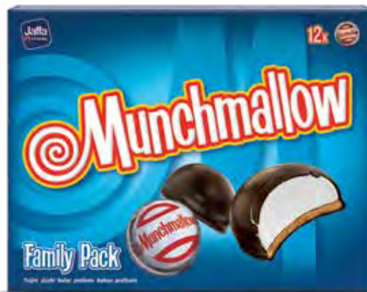
9. Munchmallow Family Pack / 210g