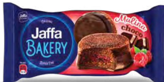
33. Jaffa Bakery Raspberry Choco / 77g