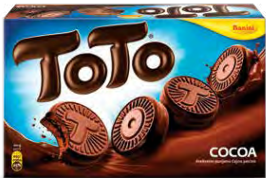
55. Toto cocoa coated / 260g