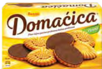
58. Domacica with cocoa coating / 230g