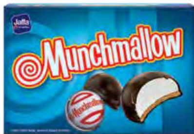
8. Munchmallow Classic / 105g