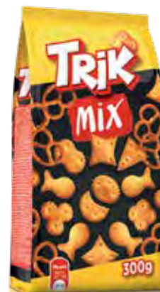
76. TRIK Mix / 300g