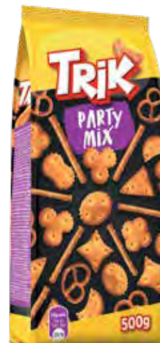
77. TRIK Party Mix / 500g