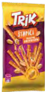
67. TRIK Sticks with peanut filling / 45g