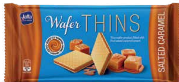
28. Wafer Thins Salted caramel / 160g