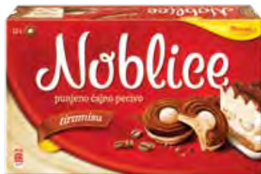
51. Noblice with tiramisu filling / 167g