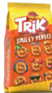
71. TRIK smiley Pretzels / 100g