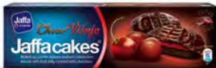
4. Jaffa cakes Choco Cherry / 155g