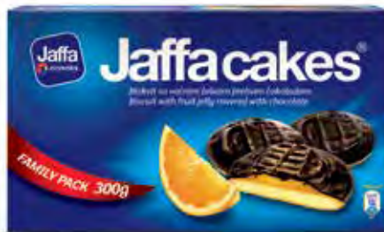
2. Jaffa Cakes Orange / 300g