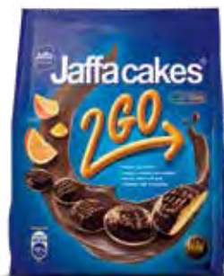
6. Jaffa Cakes Orange 2GO / 150g