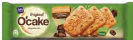
36. O'CAKE Choco / 115g