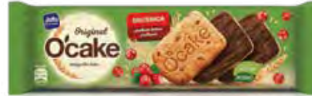
39. O'CAKE Cocoa & Cranberry / 152g