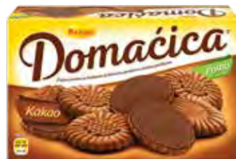
59. Domacica dark with cocoa coating / 230g