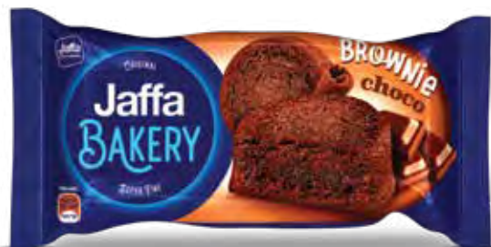
31. Jaffa Bakery Brownie Choco / 75g