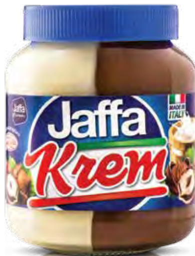
47. Jaffa spread / 750g