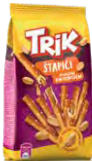
68. TRIK Sticks with peanut filling / 150g