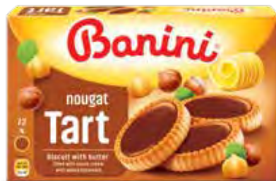
61. Domacica TART nougat / 210g