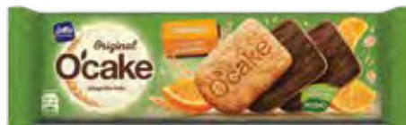
35. O'CAKE Cocoa & Orange / 145g