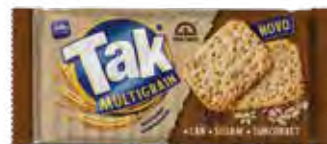
45. Tak Multigrain / 100g