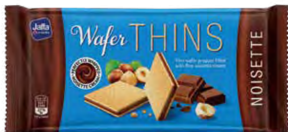
27. Wafer Thins Noisette / 160g