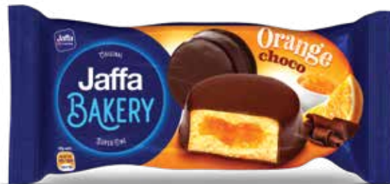
32. Jaffa Bakery Orange Choco / 77g