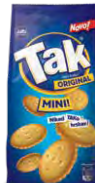
43. Tak Mini / 100g