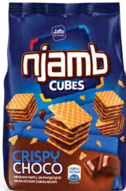
30. Njamb Crispy Choco / 180g