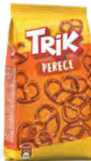
70. TRIK Pretzels / 100g