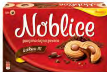
52. Noblice with cocoa filling / 250g