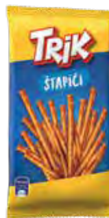
73. TRIK Sticks / 40g