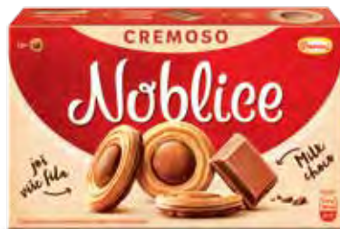
49. Noblice with milk chocolate filling / 190g