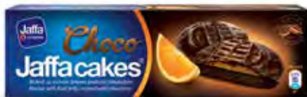
5. Jaffa cakes Choco / 155g