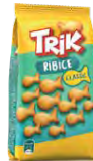
72. TRIK Fish crackers / 90g