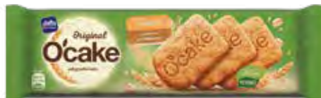
34. O'CAKE Classic / 115g