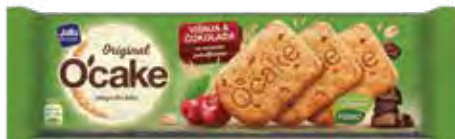
38. O'CAKE Choco & cherry / 115g