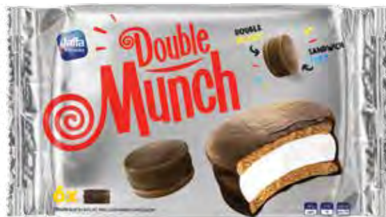
10. Munchmallow Double / 133g