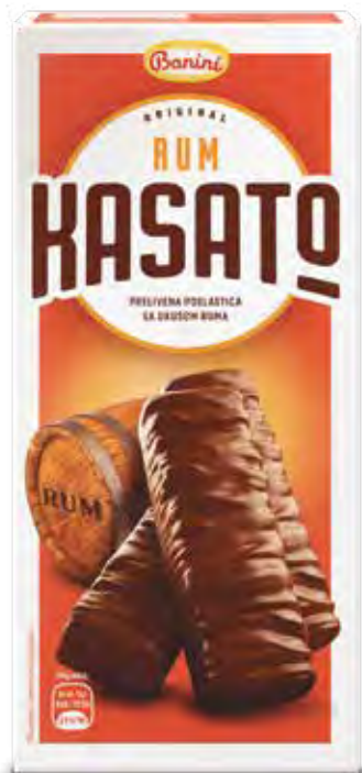
64. Rum kasato / 120g