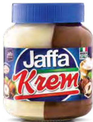
46. Jaffa spread / 400g