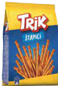
75. TRIK Sticks / 200g