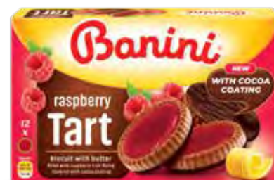
63. Domacica TART raspberry with cocoa coating / 245g