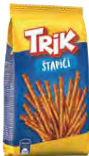
74. TRIK Sticks / 100g