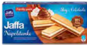
23. Jaffa wafers Whipped cream & chocolate / 374g