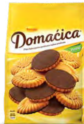
60. Domacica with cocoa coating / 550g