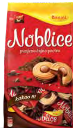
53. Noblice with cocoa filling / 350g