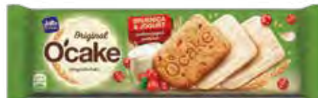
37. O'CAKE Cranberry & Yoghurt / 152g