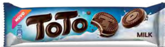
57. Toto milk / 97,5g