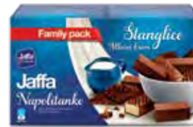
25. Jaffa wafers cocoa coated Milk cream / 360g