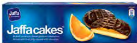
1. Jaffa Cakes Orange / 150g