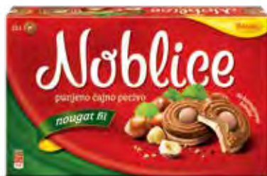
48. Noblice with nougat filling / 167g