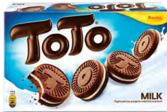
56. Toto milk / 220g