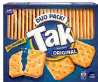
42. Tak Original / 200g