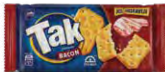
44. Tak Bacon / 100g