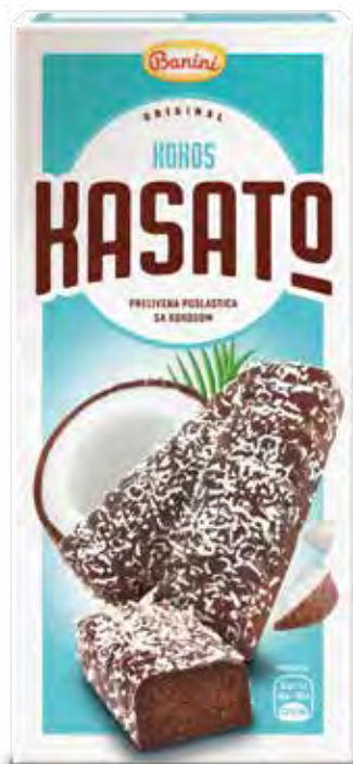
65. Coconut kasato / 120g