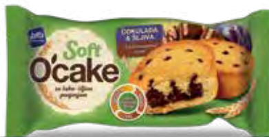
40. O'CAKE Soft Choco & Plum / 100g