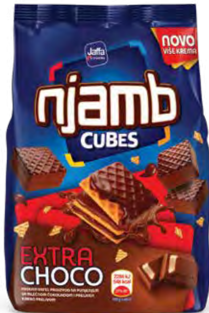
29. Njamb Extra choco cocoa coated cubes / 180g