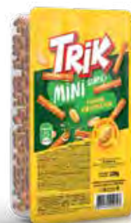
69. TRIK MINI Sticks with peanut filling / 220g