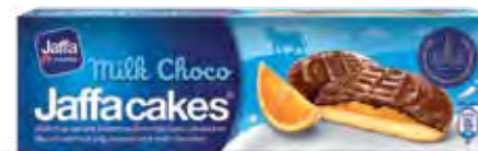
3. Jaffa Cakes Orange Milk / 158g *