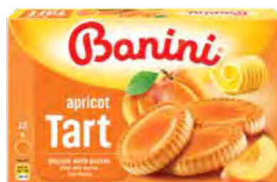
62. Domacica TART apricot / 210g