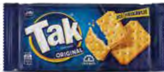
41. Tak Original / 100g