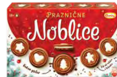
54. Noblice Winter holiday limited edition / 220g *