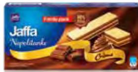
24. Jaffa wafers Crème / 374g