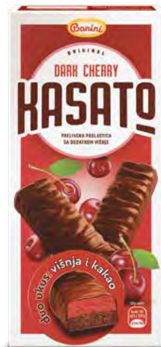
66. Dark Cherry kasato / 120g