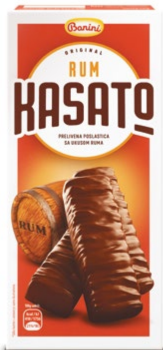
63. Rum Kasato / 120g