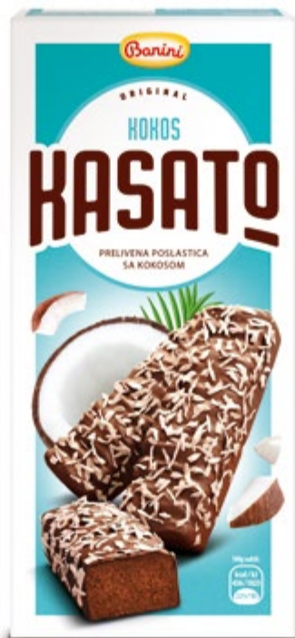
64. Coconut Kasato / 120g