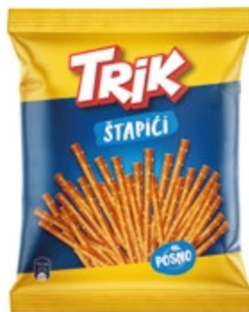
73. Trik Sticks / 200g