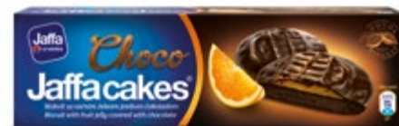
5. Jaffa Cakes Choco / 155g