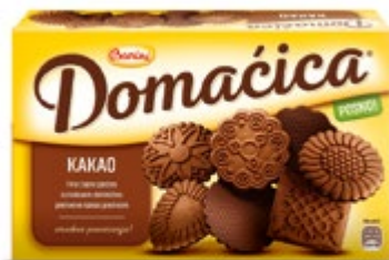
58. Domacica Dark with Cocoa coating / 230g