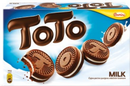
55. Toto Milk / 220g