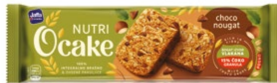
37. Nutri O'cake Choco Nougat / 115g