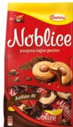
52. Noblice with Cocoa filling / 350g