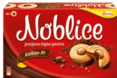
51. Noblice with Cocoa filling / 250g