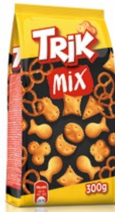
74. Trik Mix / 300g