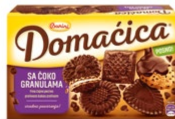
59. Domacica Chocolate Chips / 200g