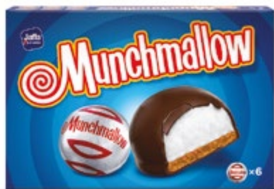
7. Munchmallow Classic / 105g