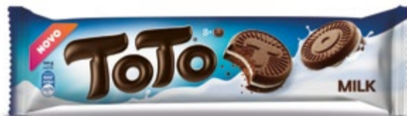
56. Toto Milk / 97,5g