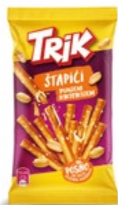
66. Trik Sticks with Peanut filling / 45g