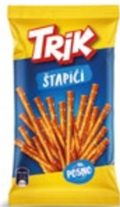
71. Trik Sticks / 40g