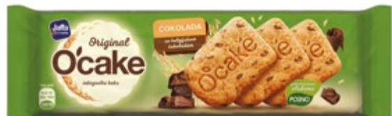
38. O'cake Choco / 115g