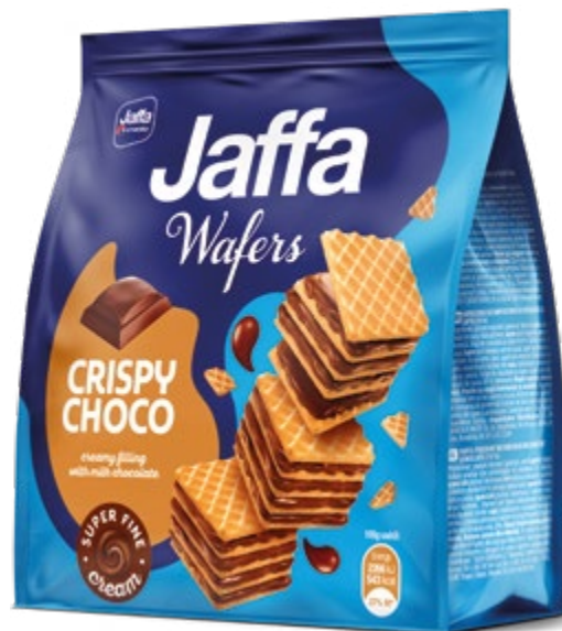
31. Jaffa Wafers Crispy Choco / 150g