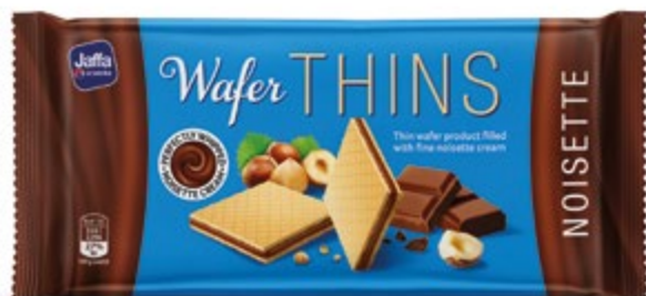
28. Wafer Thins Noisette / 125g