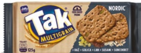
45. Tak Multigrain Nordic / 125g