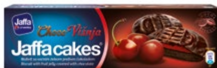
4. Jaffa Cakes Choco Cherry / 155g