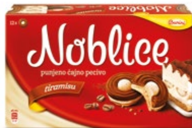
50. Noblice with Tiramisu filling / 167g