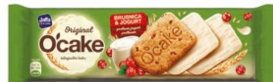
41. O'cake Cranberry & Yoghurt / 152g