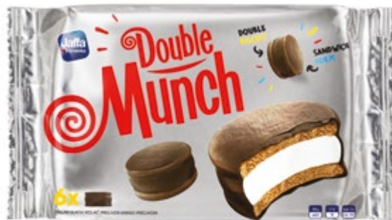
9. Munchmallow Double / 133g