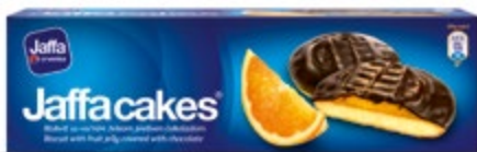
1. Jaffa Cakes Orange / 150g