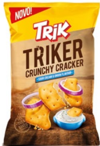
76. Triker Sour Cream and Onion / 90g