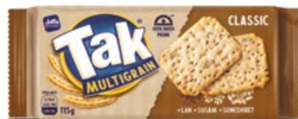
44. Tak Multigrain / 115g