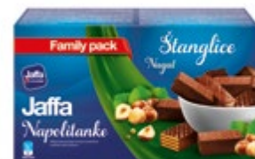
27. Jaffa Wafers Cocoa coated Nougat / 360g