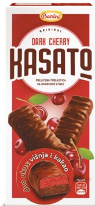
65. Dark Cherry Kasato / 120g