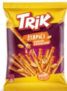
67. Trik Sticks with Peanut filling / 110g