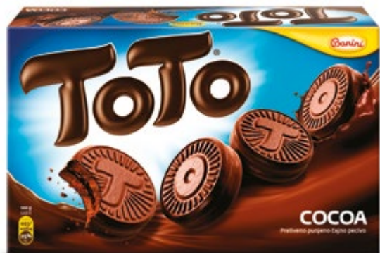
54. Toto Cocoa coated / 260g