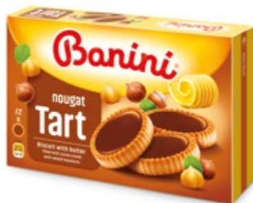
60. Banini Tart Nougat / 210g