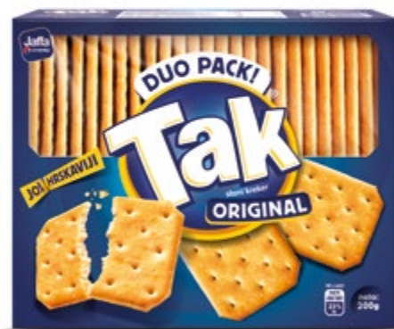
43. Tak Original / 200g