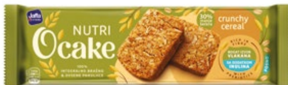
36. Nutri O'cake Crunchy Cereal / 115 g