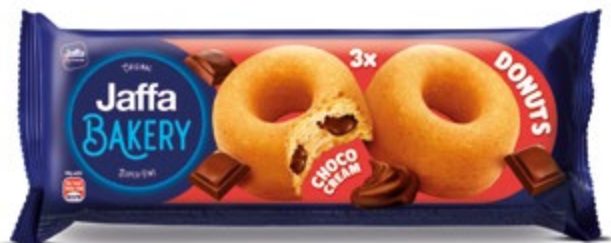
34. Jaffa Donut Choco Cream / 75g