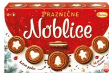
53. Noblice Winter Holiday limited edition / 220g *