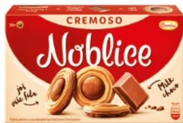
48. Noblice Cremoso with Milk Chocolate filling / 190g