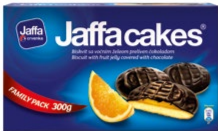
2. Jaffa Cakes Orange / 300g