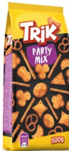
75. Trik Party Mix / 500g