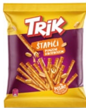
68. Trik Sticks with Peanut filling / 200g