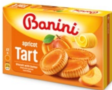
61. Banini Tart Apricot / 210g