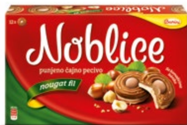
47. Noblice with Nougat filling / 167g