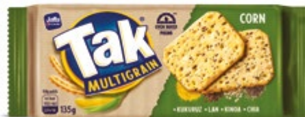
46. Tak Multigrain Corn / 135g