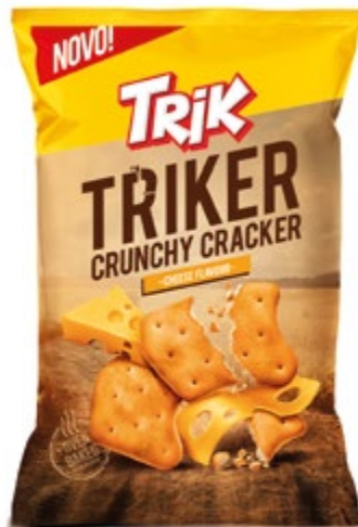
77. Triker Cheese / 90g