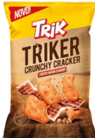
78. Triker Crispy Bacon / 90g