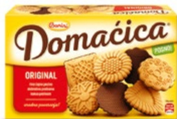
57. Domacica with Cocoa coating / 230g