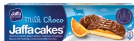
6. Jaffa Cakes Milk Choco / 158g