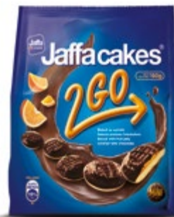
3. Jaffa Cakes Orange 2GO / 150g