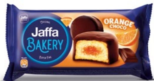
33. Jaffa Bakery Orange Choco / 77g