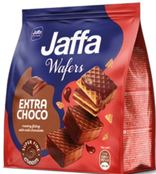
30. Jaffa Wafers Extra Choco / 150g