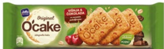
40. O'cake Choco & Cherry / 115g