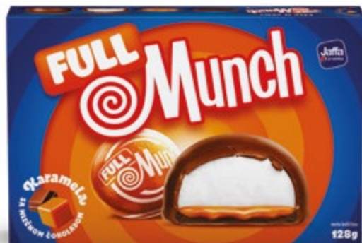
10. Full Munch Caramel / 128g