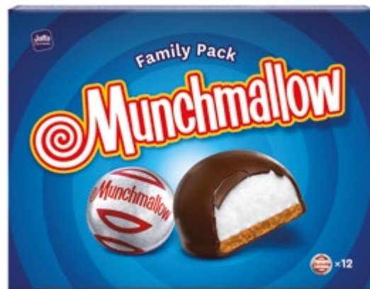
8. Munchmallow Family Pack / 210g