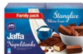
26. Jaffa Wafers Cocoa coated Milk Cream / 360g