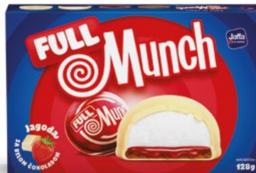
11. Full Munch Strawberry / 128g