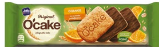
39. O'cake Cocoa & Orange / 145g