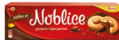
49. Noblice with Cocoa filling / 125g