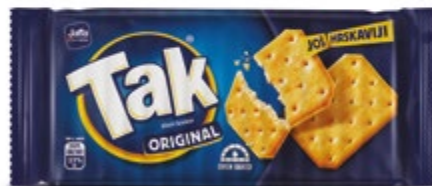
42. Tak Original / 100g