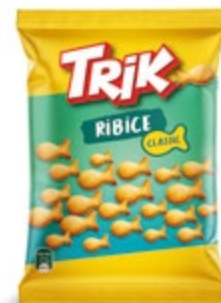
70. Trik Fish Crackers / 90g