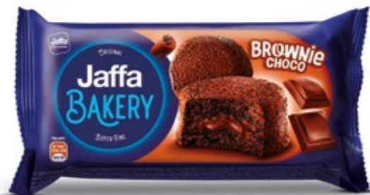
32. Jaffa Bakery Brownie Choco / 75g