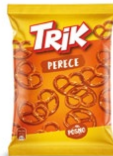
69. Trik Pretzels / 95g