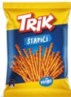
72. Trik Sticks / 95g