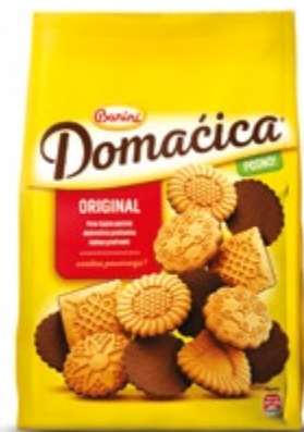
62. Domacica with Cocoa coating / 550g