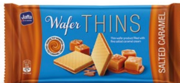
29. Wafer Thins Salted Caramel / 125g