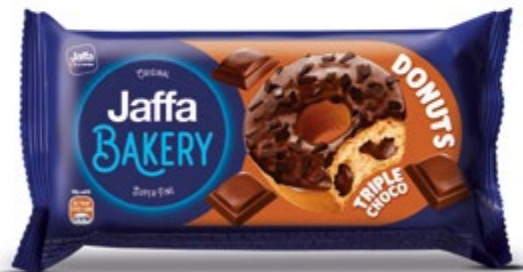
35. Jaffa Donut Triple Choco / 58g